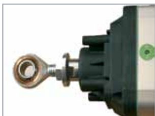
Round joint for stroke adjustment