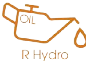
On request versions with hydraulic slowdown