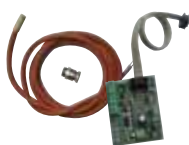
PROBE Kit to manage low temperature + LE unit + 1,8 m cable