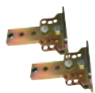
Adjustable rear bracket to screw 2 pcs